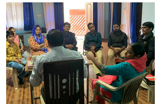
Christian leaders in Bihar strategize on introducing Portable Bible Schools in the neighboring Unreached Villages.